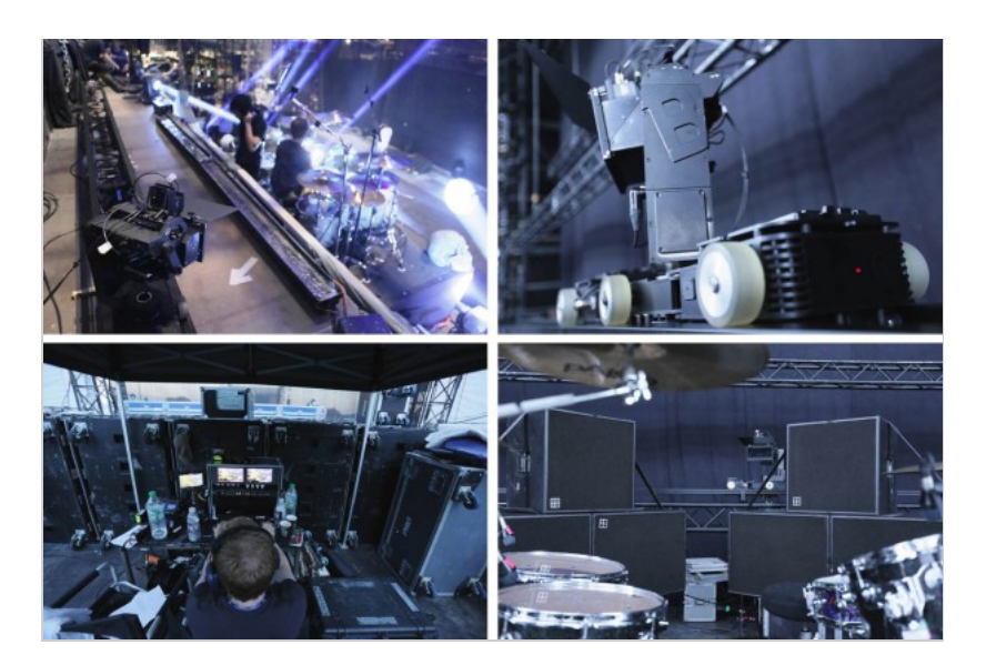
Camera 8 on BlackCam track