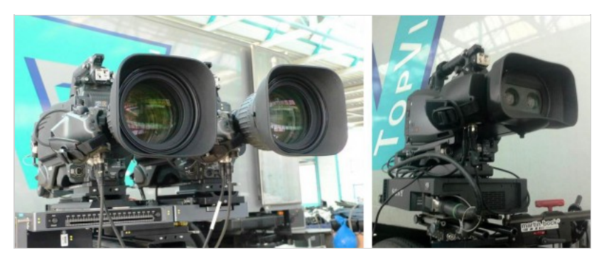
Sony HDC-1500 on Elemet Technica Side-by-Side rig and Sony PMW-TD300

Camera 7: 2x Sony HDC-1500 Vinten Quattro with Element Technica Quasar mirror rig and Canon 18x lenses