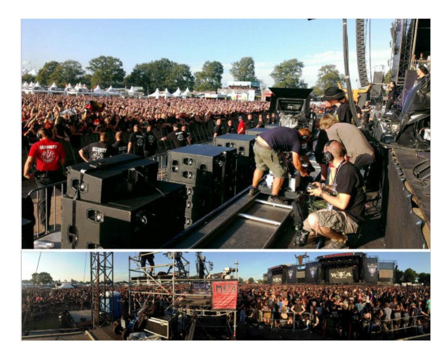
Camera 3 on a 100m rail track