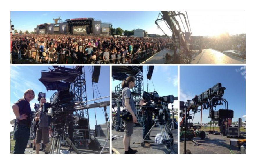
Cameras 9 and 10 on cranes from PMT

Camera 7: 2x Sony HDC-1500 Vinten Quattro with Element Technica Quasar mirror rig and Canon 18x lenses