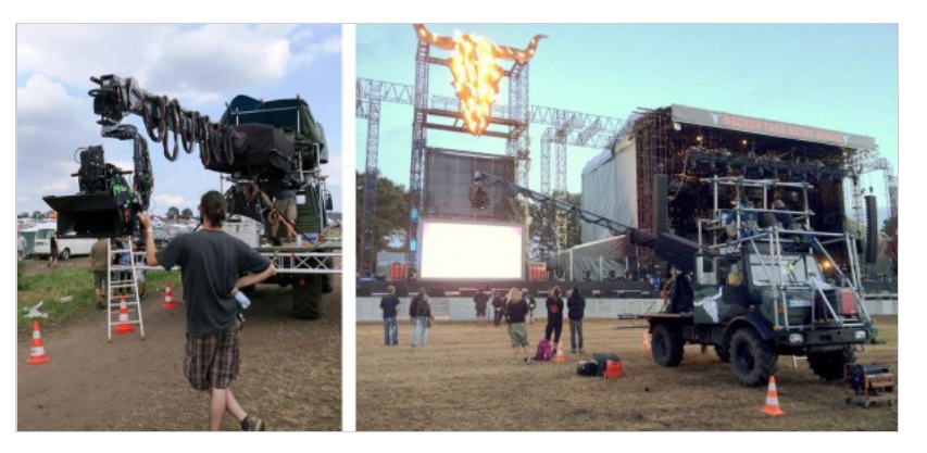
3D Fette Bilder Unit