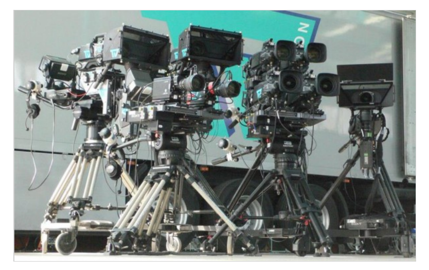
TopVision 3D Cameras on Mirror Rigs and on Side-by-Side Rigs

Camera 4: 2x Sony HDC-1500 on a Vinten Tripod with Element Technica Quasar SbS rig and Canon 21x clutchless lenses