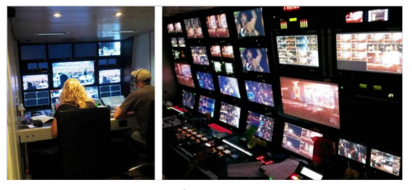
Production Area and Camera Shading in TopVision Ü1 3D

Both cranes were delivered by PMT. Special support was carried out by Sony by providing 1x MPE200, 1xHDCU1000 and 1xHDFA200 and Canon with the support of the clutchless lenses.